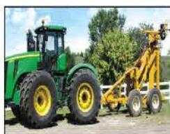
Dual Link Plow